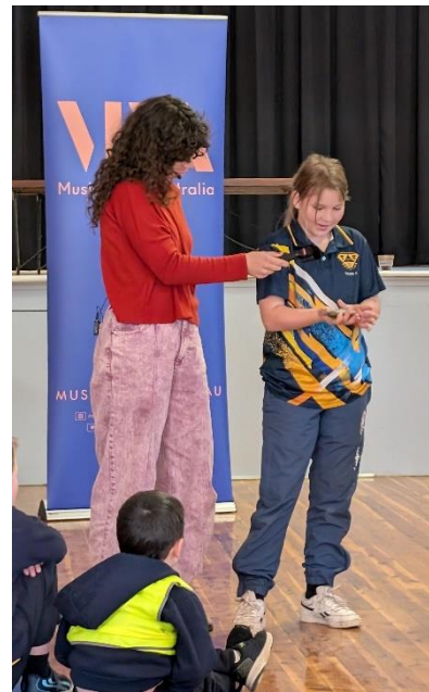
Musica Viva visit to Quandialla Wednesday, 18 th June, 2025