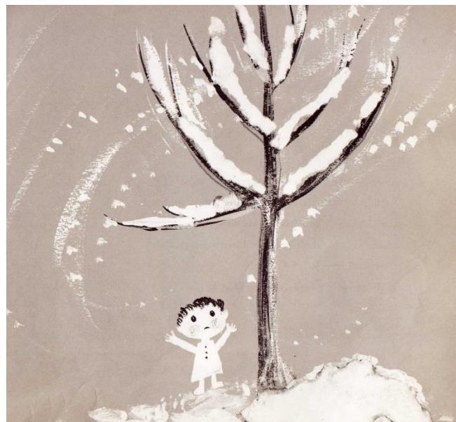
A very COLD day at Quandialla Public School

I would just like to remind students and community that when travelling to and from school, students are representing their school. While wearing a school uniform; their behaviour should reflect the values and attitudes of our school. This includes on school buses, walking/riding to and from school, or shopping/sports training in town after school while still in school uniform.