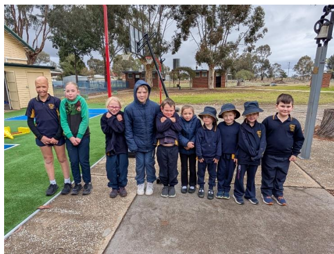
Isn't it too cold for Shorts??