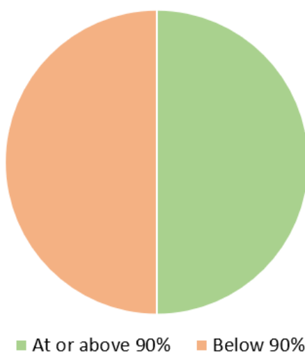
Attendance Term 2 2025

As of this reporting period, 50% of our students are achieving the attendance target of 90%. This is a slight drop from Term 1, so let's work together to reach our target of 90%. Every school day counts, and your support in encouraging your child to attend regularly is invaluable.