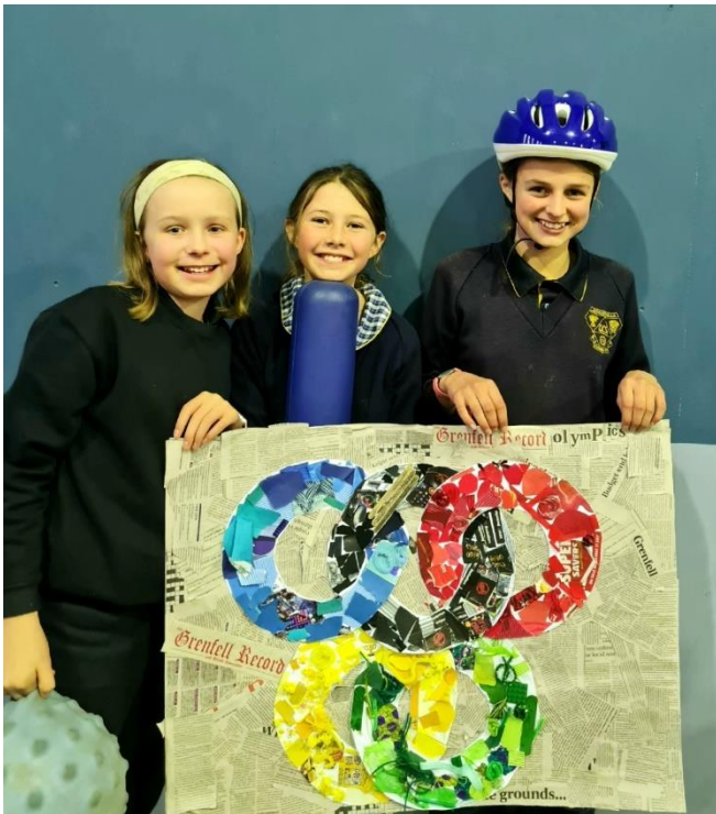
Year 6 - 2021