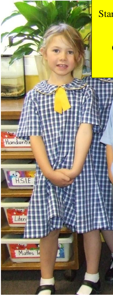
Starting Kindergarten at Quandialla Central School 2015