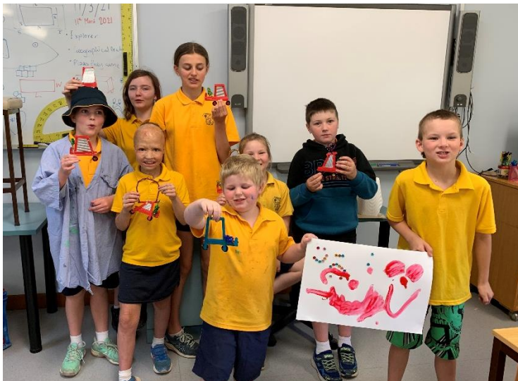
Making Christmas decorations to hang on our trees.