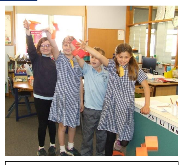
Looking at wind resistance, and learning how to make paper helicopters.

On Thursday 14<sup>th</sup> October we will hold the Book Fair. Students can come to school dressed in their Book Week costumes.