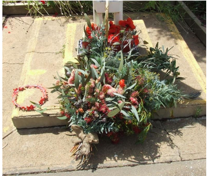
Remembrance Day at Quandialla Public School