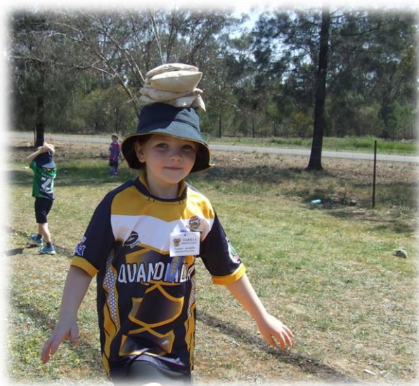
Bland Sports Carnival Friday, 20 th September, 2019