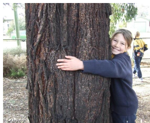
Caring for our environment.