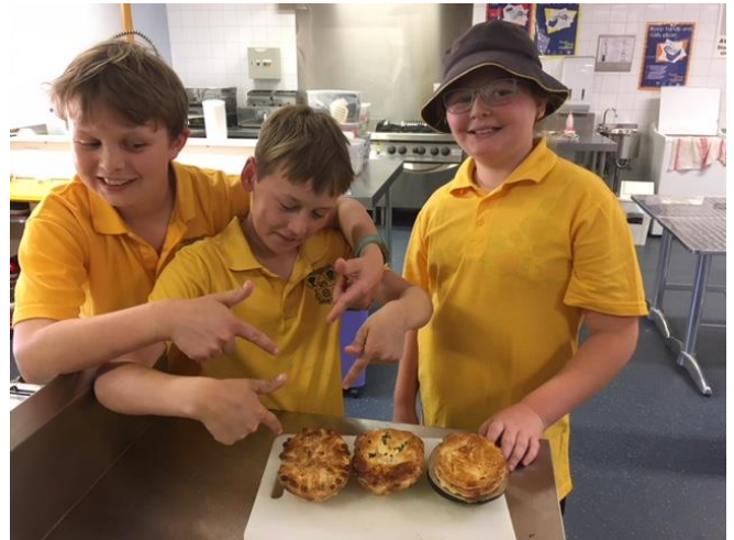
Making quiches in Stephanie Alexander Kitchen Garden, cooking lessons.