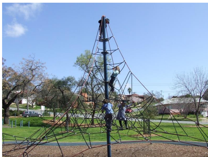
PBL Reward Excursion Monday, 31 st August, 2015