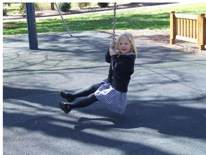
Having fun at the Wagga Botanic Gardens