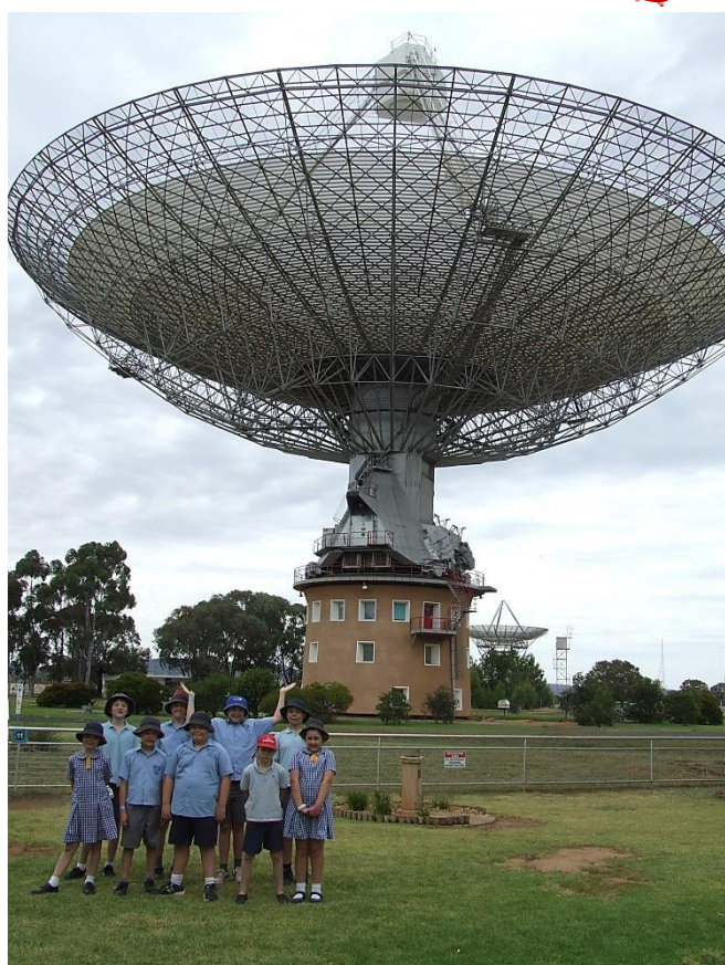
Years 3 – 6 PBL Excursion to the Parkes Telescope – Tuesday, 1 st December.