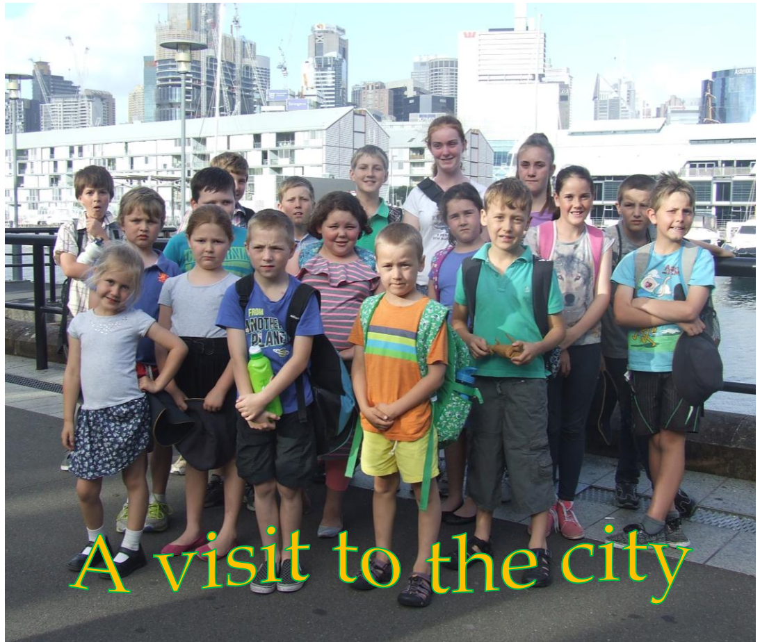
Students from Kindergarten to Year 6 enjoyed their recent visit to Sydney.