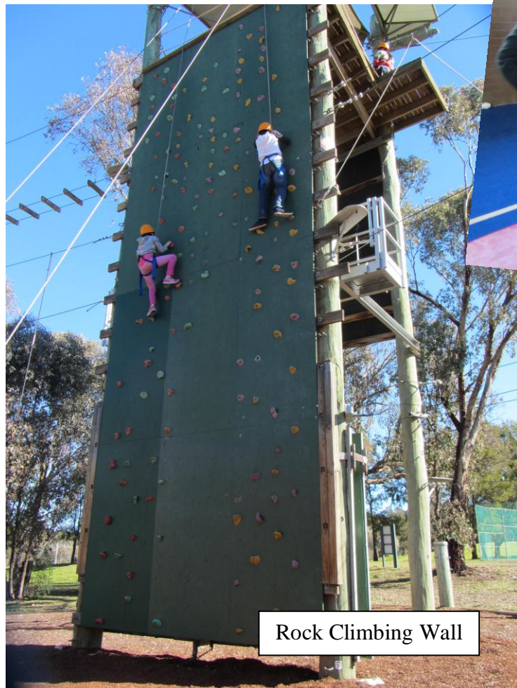
Rock Climbing Wall