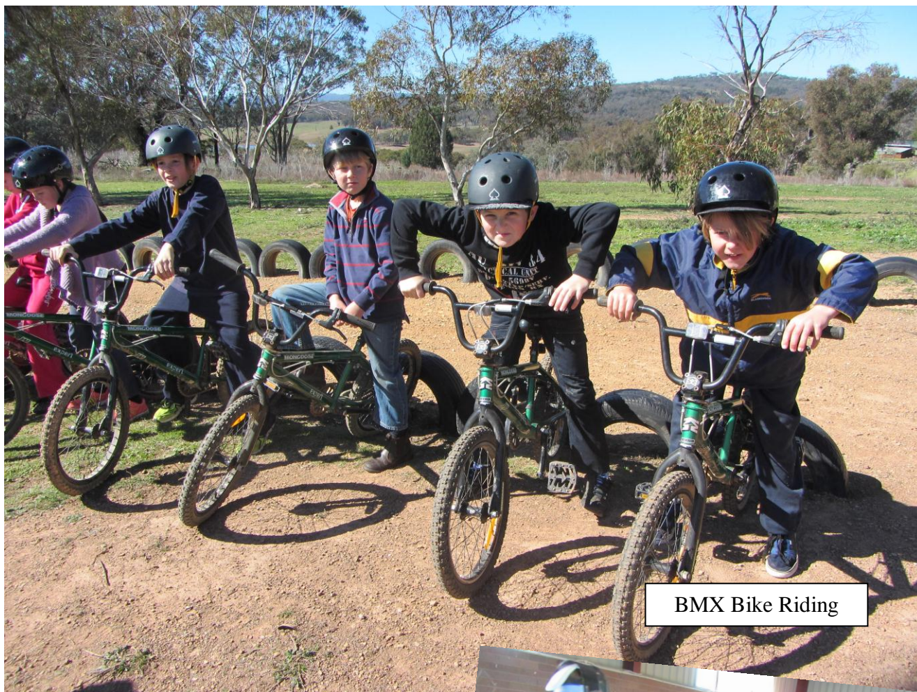
BMX Bike Riding