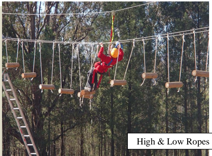
High & Low Ropes