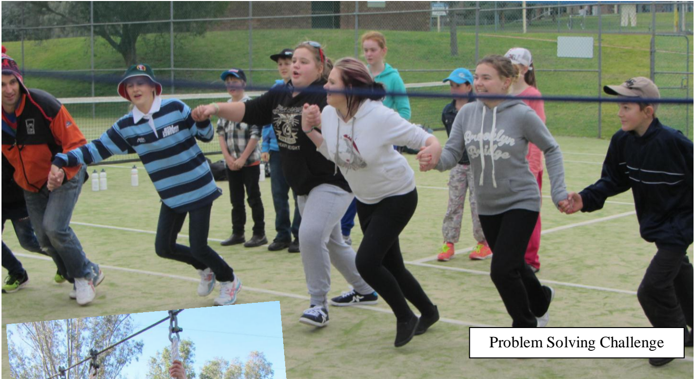
Problem Solving Challenge