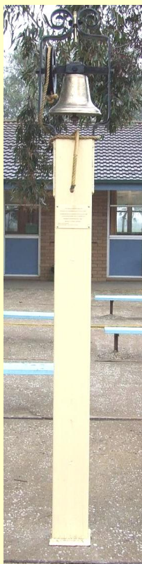
Restored School Bell - "Ready for the next 100 Years"

http://www. quandialla- c.schools.nsw.edu .au/sws/view /home.node