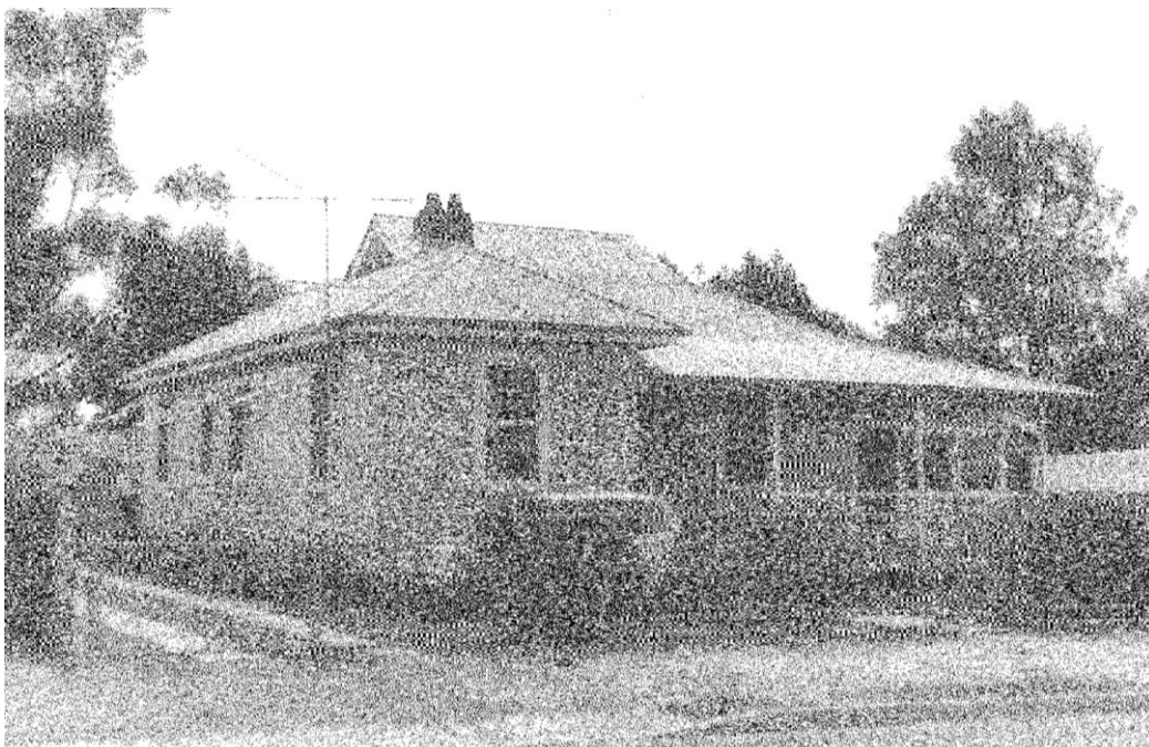
Quandialla Central School – Principal's Residence, 1973