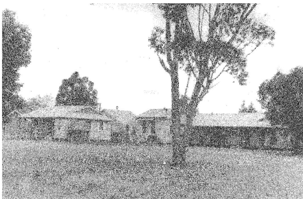
Quandialla Central School - 1973