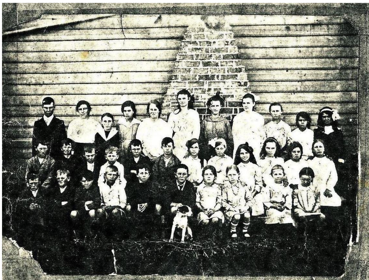
Pupils of Quandialla Public School – Dated: 1918

If you can help with old photos of school buildings, students, special functions etc. it would be greatly appreciated. All items can be scanned and given straight back. Thank you for your assistance.